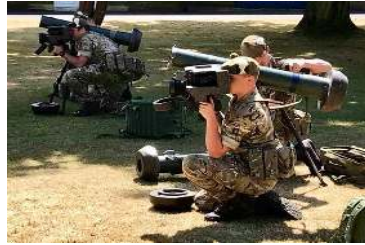
2 SCOTS Rear Ops Group

The Rear Operations Group (ROG) have maintained their busy training packages which has been inclusive of supporting the Javelin Division on their FTX in Salisbury Plain. They were put through their paces in operations ranging from delays to urban Ops.