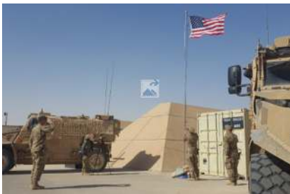
The Stars and Strips are raised.