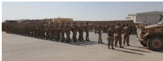
3 SCOTS march on.

Back in the UK the ROG prepared and recovered the Trg Coy as it returned to the Fort. It then began preparing for the main body mid-July. The Bn has spread out it's summer leave and the majority of returning Op SHADER personnel have now gone on post-tour leave. The Bn will complete a full-scale re-orbat last week in August with the focus being on 'back to basics', battle craft syllabus and support weapons cadres; all in preparation for a busy training year in 2019 for NATO high readiness in 2020.