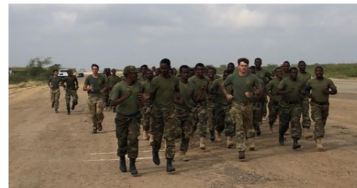
Team 12 with the Somali National Army on morning PT