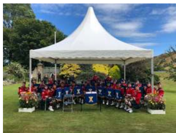
The SCOTS Band at Holyrood Palace