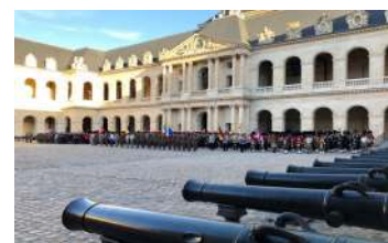
The Massed Bands of the Paris International Military Music Festival

perform for Her Majesty as she entered the cathedral for the annual Order of the Thistle service. It was a hard but rewarding week and the Band took a well-earned annual leave afterwards.