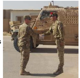
CO 3 SCOTS hands over to the new DCom Security.

3 SCOTS Sy Force Coy group have handed over to the US Army 3rd Cavalry Regiment and with that the large logistical challenge of drawing down the UK presence at Al-Asad began. The last month has seen the security company gradually withdraw from tasks to enable a seamless transition to a US led force. It was no easy task. For the past three years the UK contribution to security at Al-Asad Air Base has been front and foremost, from the largest manpower contributor, to the equipment on posts and the core of the C2 structure - manpower and equipment. With the handover complete, the soldiers focused on preparing the equipment for transit back to Cyprus, the UK and elsewhere.