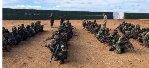
Team 8 conducting final lessons with the Somali National Army in Baidoa

B Coy have moved into uncharted territory, after having members of the Coy deployed since Aug 17. They will fulfil tasks as they arise, attend career courses, take leave, manage the turnover of troops and welcome new Spec Inf Soldiers.